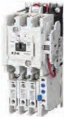
Size 1 Reversing Starter